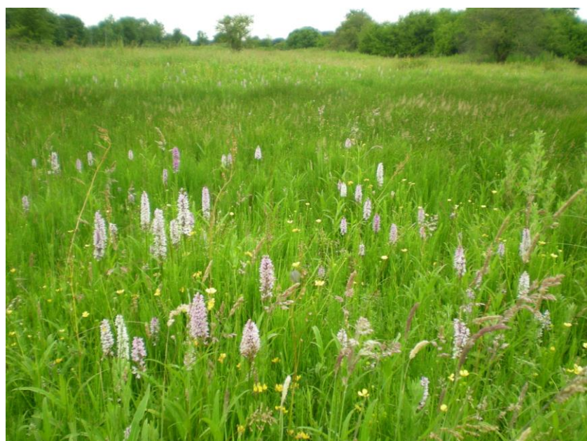
Orchids on a County Wildlife Site

It should be stressed that notification does not confer any rights of access either for the general public or nature conservation organisations; it is simply recognition of a site's nature conservation value.